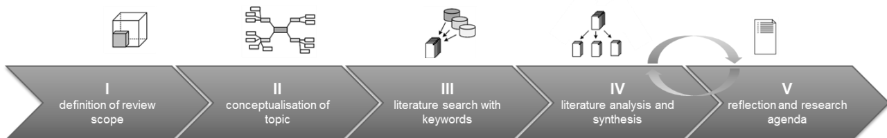
Figure 1: Framework for literature reviewing [9], [6]

The Framework of VOM BROCKE et al. is used for the literature review to meet requirements of a methodologically sound and scientifically appropriate way of working with literature analysis [9]. Fig. 1 shows the procedure.